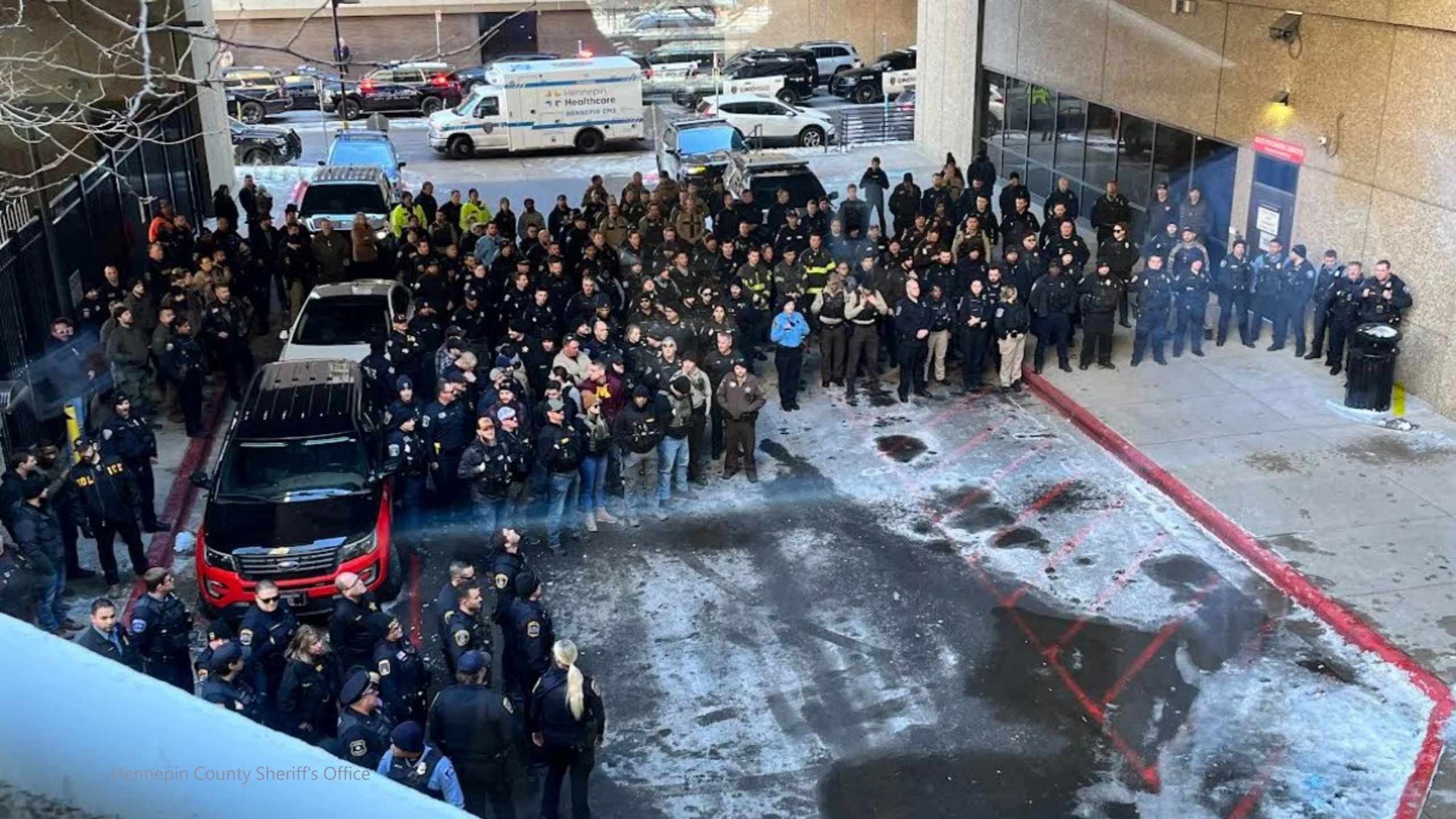
Hennepin County Sheriff's Office